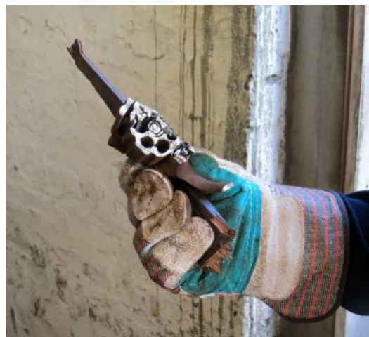
Demonstration of how cutting with the hydraulic shears renders the weapon inoperable.

For more information on UNLIREC visit ( www.unlirec.org .)