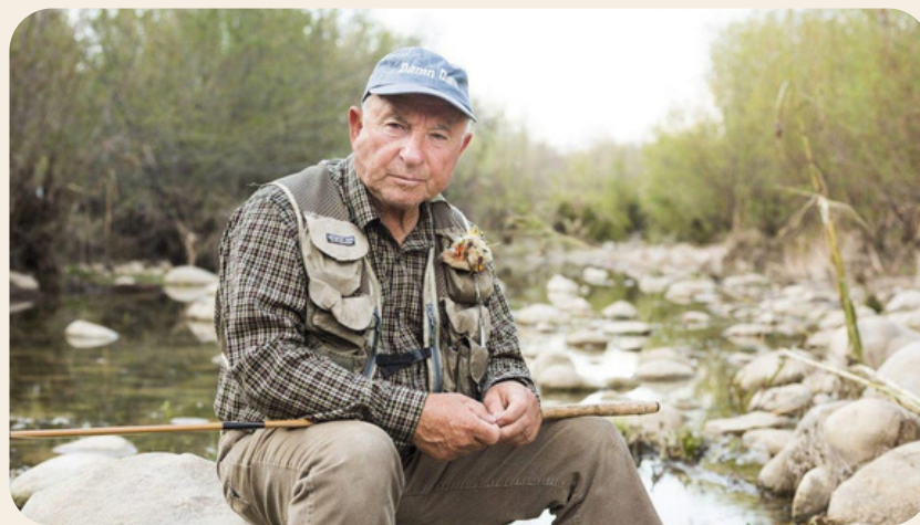
Yvon Chouinard