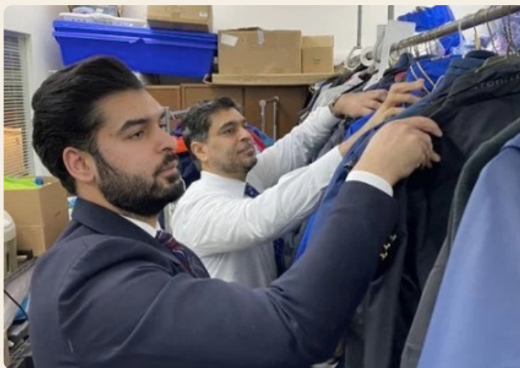
Members of the Rajpoot Family